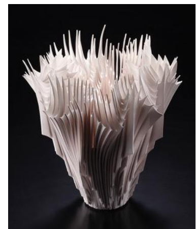
"Bone Flower 2" by Yuki Nara, Artists in Taiwan, Taiwan, Room 4312

Yuki Nara (b. 1989) is a descendant in a long line of famous Japanese ceramists. Nara's aim is to create ceramics that are light and transparent rather than the conventional and dignified ceramics. To achieve his goal, Nara studied architecture in order to learn and incorporate architectural modeling techniques into his sculptures. According to Nara, ceramics are able to absorb its surroundings and retain the special mood of its place, gently connecting, rather than separating, the interior from the exterior.