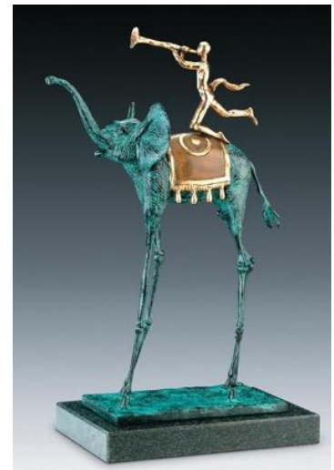
"Triumphant Elephant" by Salvador Dalí, Appraisal & Collection Fine Arts, Hong Kong, Room 4321

Salvador Dalí (1904-1989) is a surrealist painter who also delved into sculpture, printmaking, fashion, advertising, writing, and filmmaking. Famous for his larger than life personality and role of mischievous provocateur as much as for his undeniable technical virtuosity, Dalí is known for using psychoanalytic methods of mining the subconscious to generate imagery. He is considered one of the three most representative artists of the 20 th century alongside Pablo Picasso and Henri Matisse.