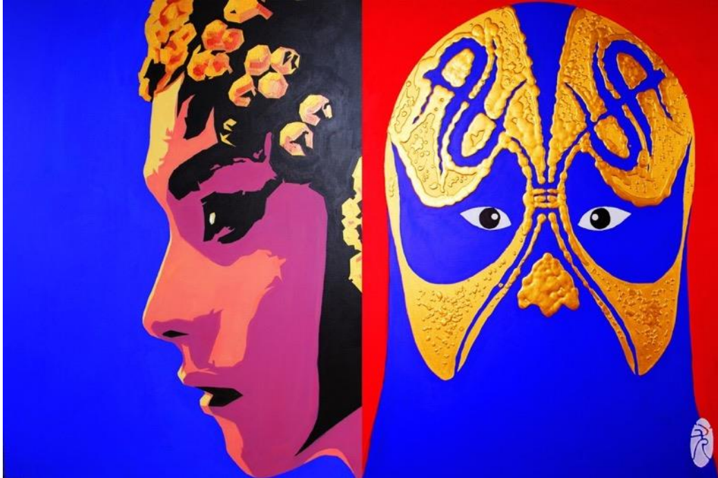
"Farewell My Concubine No.1" by You Yang, Nancy's Gallery, China, Room 4218