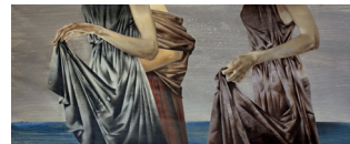
Migration, 2017 Size: 55x110 cm Medium: Oil on canvas