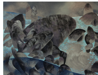
Coast, 2014 Size: 59x80 cm Medium: Oil on canvas