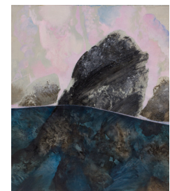
Waves, 2016 Size: 50x45 cm Medium: Oil on canvas