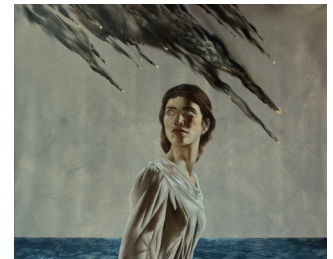
The Doom of Pompeii, 2014 Size: 92x100 cm Medium: Oil on canvas