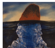
Concealment, 2017 Size: 33x38 cm Medium: Tempera, pastel, collage on cardboard