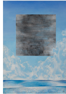
Calm, 2017 Size: 70x50 cm Medium: Oil on canvas