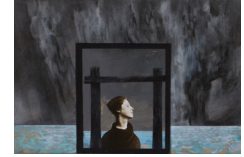
Penelope, 2013 Size: 32x47 cm Medium: Tempera, coal on woodboard