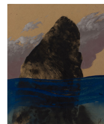
Cliff, 2017 Size: 40x34 cm Medium: Tempera, acrylic on cardboard